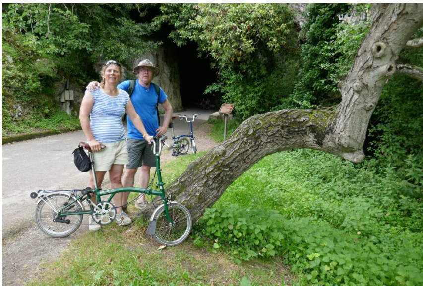
Out & about – Cuevona's Cave in Ribadesella

14.50 we dropped anchor in the Ria de Cedeira. Log 24.7 NM. While at anchor we again gave the engine a good look over, changed the Fuel Filter & the Fuel Lifting pump that I had bought last year as a backup - This seems to have fixed the issue. The following morning while lifting the anchor to leave we realised that we had snagged an underwater cable – more fun to get unstuck !