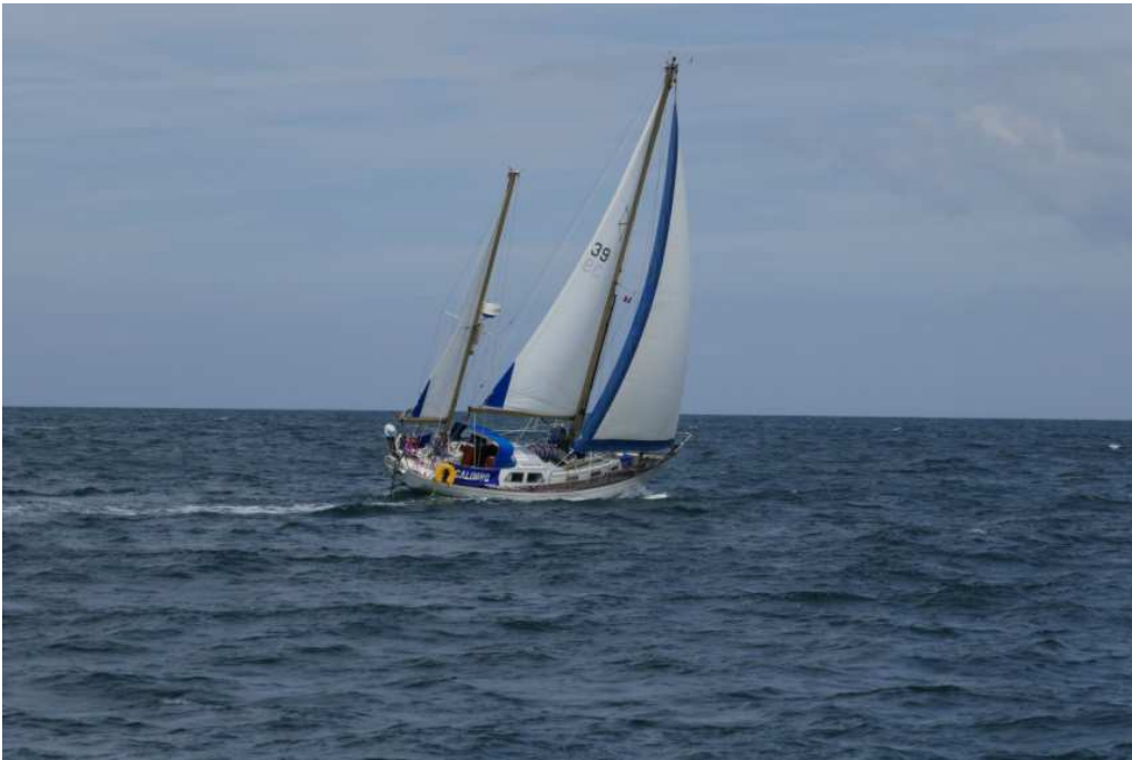
Calimbo – Sailing to Weather