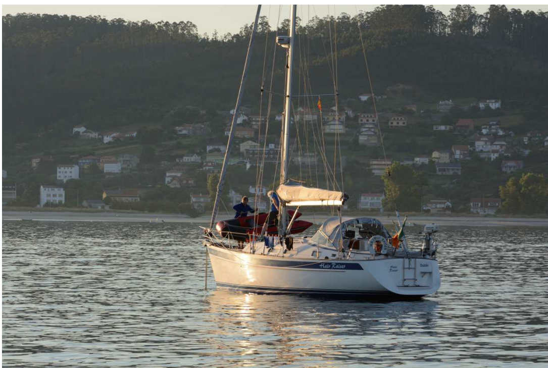
Ria de Cedeira – We snagged the anchor here on an Underwater Cable – great fun !!!