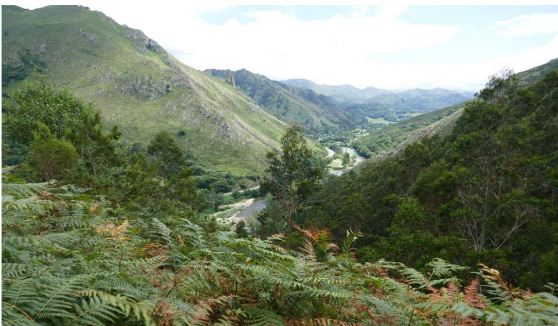
Picoes de Europa in Asturias,