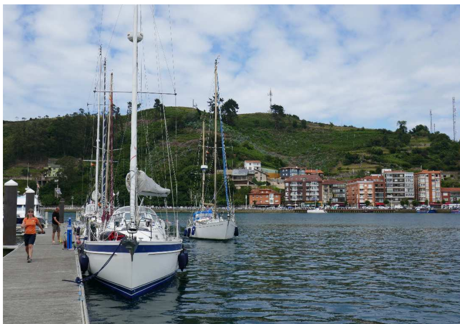
Three Ladies - Aine, Hair Raiser & Calimbo

Over the next eight days we continued our daily hops east along this dramatic coast and visited Viveiro, Ribadeo, Aviles, Ribadesella, Ria de Suances & Santander – all very interesting places with plenty to see & do.