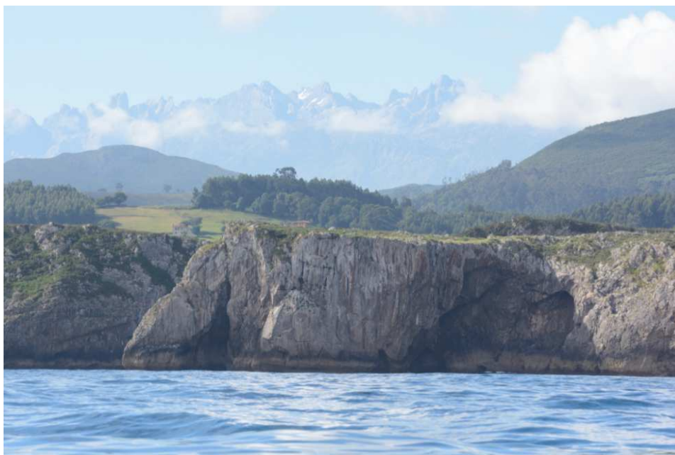
Snow Capped Mountains – Picos de Europa in Asturias.

Over the next eight days we continued our daily hops east along this dramatic coast and visited Viveiro, Ribadeo, Aviles, Ribadesella, Ria de Suances & Santander – all very interesting places with plenty to see & do.