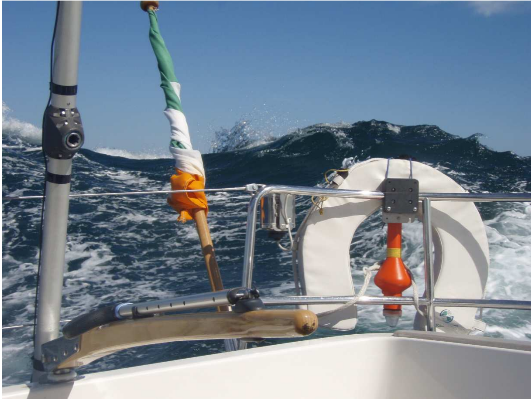
Hair Raiser - Hallberg Rassy 342