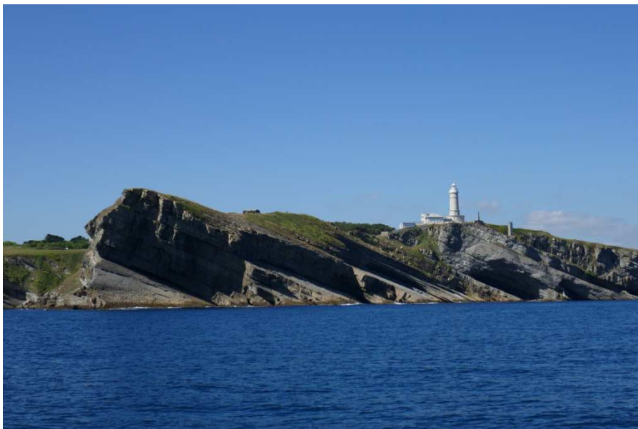
Cabo Mayor – Entrance to Santander

The weather for the next few days was reasonably good but after that we were going to get a stretch of Northerlies and because we had crew changes in La Rochelle in about a weeks' time we thought it prudent to make the 200NM trip before the northerlies set in.